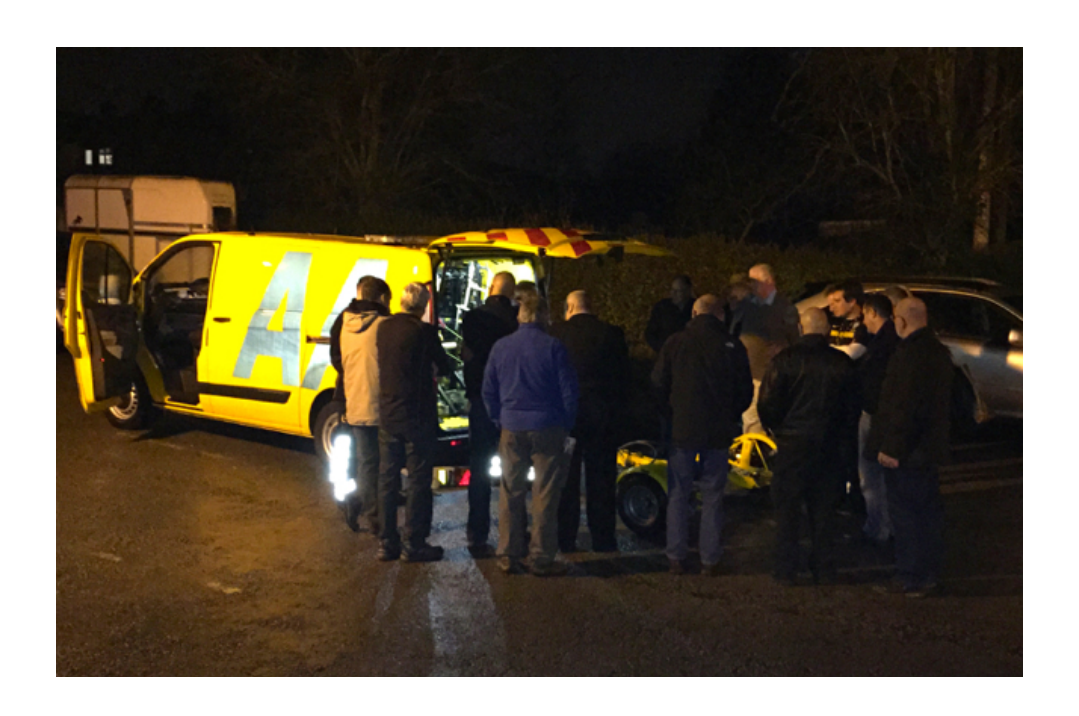
The group getting a close-up view of a modern-day AA patrol van